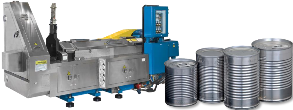
DWI round can systems from 1000 to 1500 CPM

Stolle is known for supplying high volume beverage can machinery, but we also offer a wide range of 2-piece food can technology. From individual machines to complete production lines and plants, we can accommodate all food can shapes, sizes and volume requirements. Talk to us – we can do what you want!